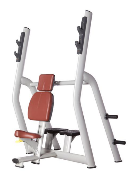
H-25B VERTICAL BENCH

Exercise position:Pectorals,Biceps,Deltoid